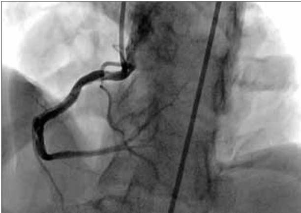
Figure 1. A left anterior oblique angiographic view with cranial angulation of the right coronary artery. A continuous intraluminal linear transparency is evident from the proximal part of the vessel. This picture strongly suggests dissection of the vessel wall.

ChromaFlo, a modality that depicts blood flow by comparing sequential axial IVUS images and interpreting any differences in the position of echogenic blood particles as blood flow (Figure 2B). The ChromaFlo study confirmed unobstructed flow throughout the dissected segments. No atherosclerotic plaques were imaged on the IVUS pull-back.