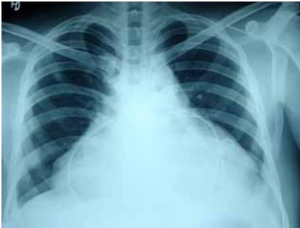
Figure 1. Chest X-ray showing epicardial pigtail drain in situ .

morphs (15%), and abundant red blood cells. Bacterial, fungal and acid fast bacilli cultures were negative and cytology was not diagnostic for malignancy. Other routine laboratory tests were normal. The patient was continued on ATT and intravenous broad-spectrum antibiotics were added.