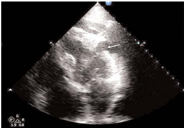
Figure 2. Transthoracic echocardiogram: apical 4-chamber view (arrow).