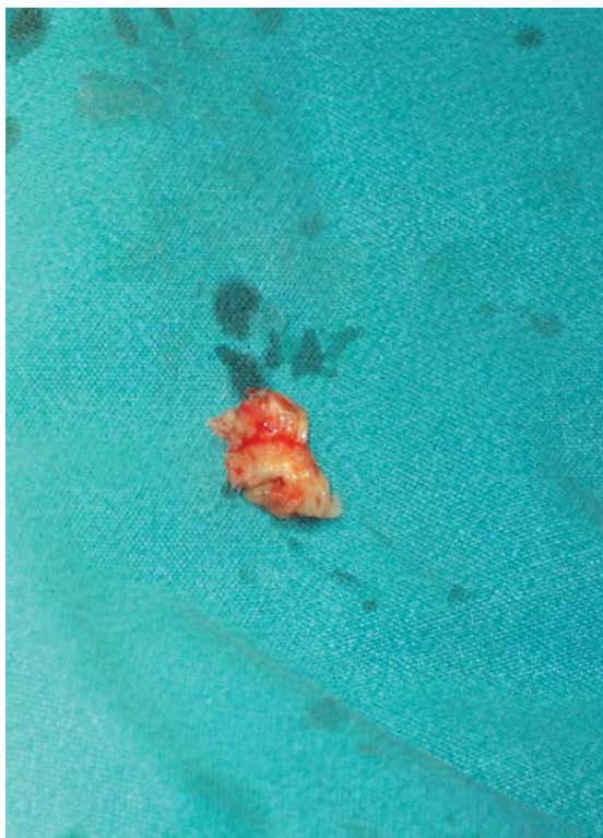
Figure 1. Vegetation on a section of the anterior mitral valve leaflet.

The patient underwent median sternotomy with total cardiopulmonary bypass. The mitral valve was degenerated and insufficient with vegetation oriented on the anterior leaflet (Figure 1). The aortic valve was