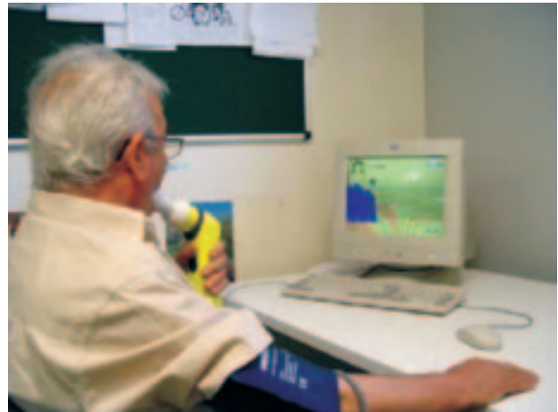
Figure 1. Patient performing inspiratory muscle exercises.

His HR increased (from 84 to 92 bpm) during training (at respiratory fatigue) but the mean arterial BP did not (89.5 vs. 87.8 mmHg). Post-IMT, inspiratory muscle